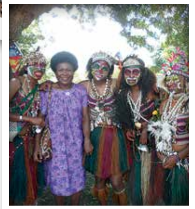
Myself with Sepik Club Cultural Group Girls.