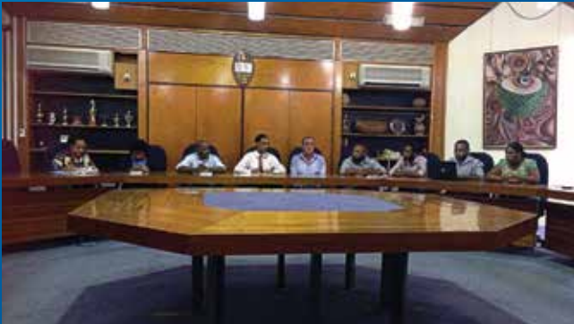
UPNG Council Chamber

There are special moments in our working days where we confronted with news which makes us sit back and say 'wow'.