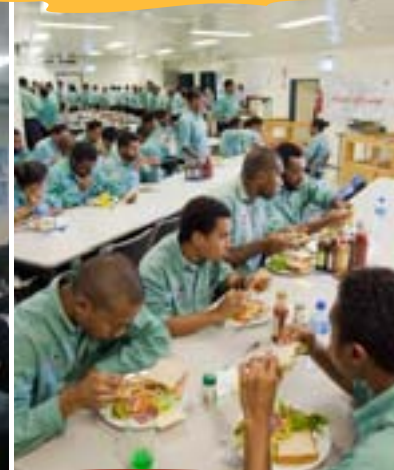
iPi Catering - Nutrition Training Seminar