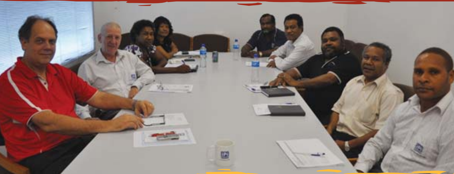
Senior iPi Group - Finance people at the conference