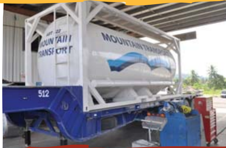
Specialist ISO Tanker used for the PJV Bulk Cement Haulage

We are most pleased to announce that iPi Transport has now commenced the first deliveries of Bulk Cement directly from the Taiheiyō PNG Cement Plant in Lae through to the Porgera Gold Mine.