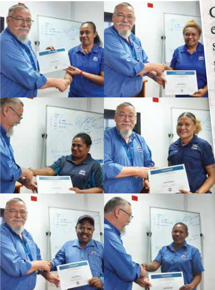
Post Courier Page 42, Thursday 29th June 29, 2023