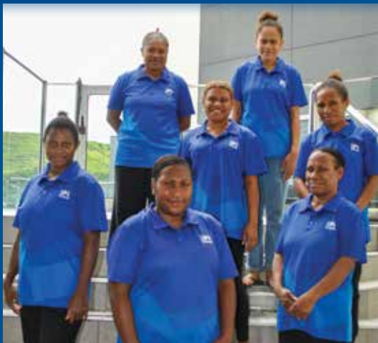
The dedicated iPi on Airvos Housekeeping team.